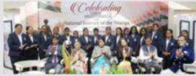
India's visually impaired women's cricket team, which won the T20 World Cup cricket, was felicitated at the event

On Saturday, at Jindal House in Delhi, an event was held to mark the anniversary of the Supreme Court judgment that democratised the use of the national flag and also to felicitate India's visually impaired women's cricket team that won the T20 World Cup recently. As guests left the delightful luncheon where top